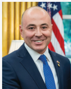
Andrei Muraru Ambassador of Romania to the United States

This tour is also a masterful exhibit of the theme chosen for this year's public diplomacy efforts by the Embassy of Romania to the United States - "Romania and the United States: A Partnership for the Future. Celebrating Romanian Talent". Romania and the United States are close friends and allies not only in fields like security, energy, economy and education but we also have strong cultural ties.