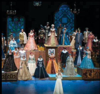
2023: Period costumes created by scenographer Iuliana Gherghescu