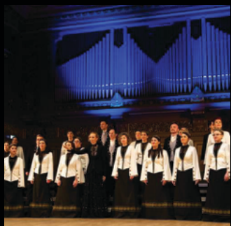
2018: Costumes inspired from the interwar period of Romania