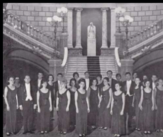
1964: The first modern concert costumes