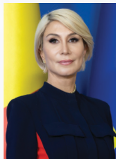
Raluca Turcan Romanian Minister of Culture

The Madrigal Choir is one of the strongest cultural links between our country and the world. The Romanian Ministry of Culture proudly supports the Madrigal Choir as a reputed ambassador of our cultural values in the United States.