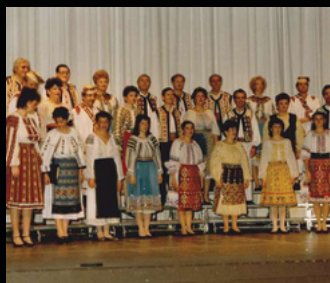
Authentic Romanian folk costumes used in over 100 concerts in the USA in 1984 and 1988